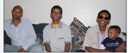
Some of my English students

In March I met some refugees from Eritrea, a small country north of Ethiopia. They're all beginning English speakers & I volunteered to