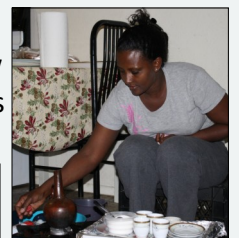
One of my students making traditional Eritrean coffee—yes, you only need a little bit in a tiny cup!