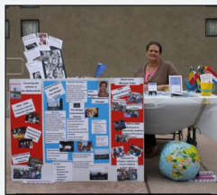
Missions Craft Fair

Some of my colleagues with The Bridge have connections with Victory Worship, another church in Tucson. Having these mutual connections from the other side of the world is exciting! Earlier in the year I participated in a craft fair sponsored by Victory Worship to raise money for missions. I had a booth with information about The Bridge and I was able to raise money toward my missions work by selling Paris & Africa themed bookmarks & photo cards. I've continued to sell these handmade items since then—and I really enjoy all the opportunities it creates to meet people interested in my work with The Bridge .