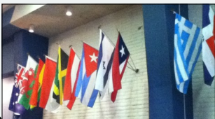
Just a few of many flags at Grace to the Nations—a wonderful reminder of all the nations & cultures throughout the world!