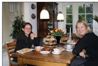
High tea with some colleagues from the International School of The Hague

I also got to see a few of the children I worked with in speech-language therapy ~ it's always fun to see how they've grown and progressed!!!