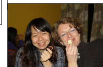
Enjoying Belgian chocolates!

working in the Netherlands, and a few are now married! Being with these dear friends really ignited an excitement for working with international students in Paris. I envision building special relationships with many students through small groups or through English tutoring, etc.