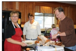
My sisters & brother-in-law—really carving the turkey!