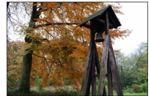
Autumn colors in Baak, in the Achterhoek region of the Netherlands

Delft was my home-base for the next 2 months, and I made some short trips nearby. I visited friends in Amsterdam and enjoyed some autumn colors in the eastern part of the Netherlands. The timing of my trip meant a change of season from summer to autumn, and therefore a need for warmer clothes and, little by little, a decrease in the amount of daylight!