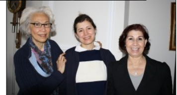
With English class students—from the Netherlands, Iran, Iraq, Indonesia, and Belgium. I'm so glad to call them friends!

Denver ~ I've been back in the States since Thanksgiving. I first spent 3 weeks in Denver, Colorado where I grew up. Almost all of my immediate family lives there, so it was great spending time with them! I also caught up with friends while I was there, some of whom I hadn't seen for 10 years or more! It really means a lot to me how everyone has been so interested in the work I'll be doing with The Bridge . My team of partners continues to grow one person at a time!