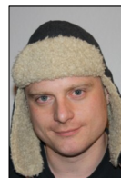
3 nephews & 3 brothers...