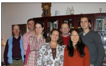
With friends in Delft

Re-connecting ~ An even greater highlight, of course, was re-connecting with friends and colleagues. I loved hearing their latest news, and I appreciated how everyone was so interested in my plans to return to Europe and work with The Bridge in France. Several people have joined my team as financial and/or prayer partners - something I'm very thankful for and excited about! I also have new friends that I met during my time in Europe. I look forward to staying in touch - building both old & new relationships!