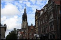
The main market square in Delft

Delft ~ I then returned to the Netherlands and stayed in Delft - the city where I lived for 4 1/2 years until September 2009. I was right at home - it was as though I'd never left! I loved riding my bike again to go visit friends and for quick shopping trips into the city center. It was surprisingly easy to tap into my Dutch language skills after a year - and as always, I understood better than I could speak :)