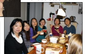
Asian friends eating with chopsticks, of course!