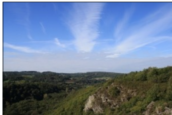
Landscape in southern Normandy—also known as Swiss Normandy