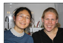
Friends from China & the Netherlands