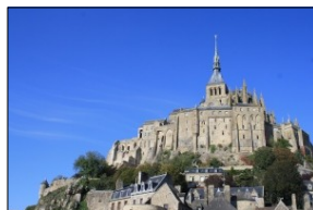
Le Mont Saint-Michel