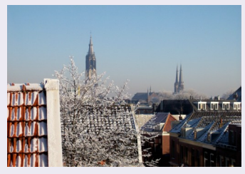
Winter view of Delft from one of our windows