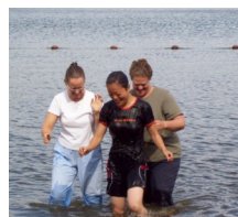
Baptism at the lake