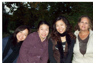
Friends from home group

For 3 years I've been co-leading an international women's home group. I love spending time together sharing about what's going on in our lives, praying for each other, studying the Bible, and learning to know God through a personal relationship with Jesus. The highlight, without question, is when a young woman gives her heart to Jesus. And we've joined many at the local lake where they choose to be baptized in water – an exciting adventure, especially in the winter!