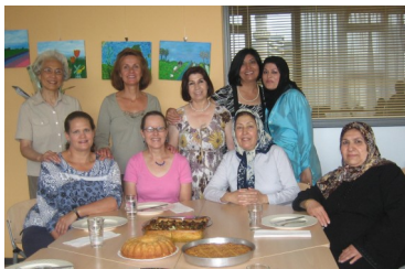
Lunch with some of our students