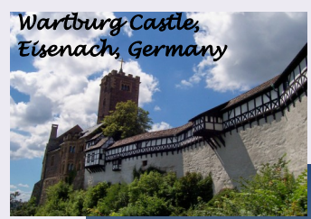
Wartburg Castle, Eisenach, Germany