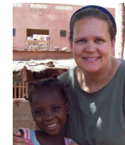
Sharing a smile with a new friend in Mali!