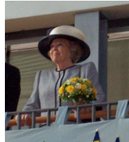
Queen Beatrix at ISH