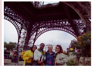
Some of the outreach team at the Eiffel Tower

My experience as an English teacher in Delft has shown me that teaching English in France will create connections with people from all over the world—something I really love! It's very exciting that my desire to teach will allow me to work in the mission field in France. This next season for me is an opportunity to be both a teacher and a missionary, or in other words a “teaching missionary”! My goal is to work part-time, which gives me legal permission to be in France, and then devote the rest of my time to “building The Bridge” in Paris.