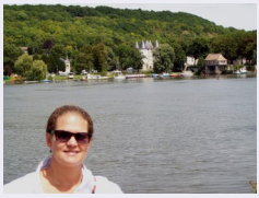
Recent trip to Giverny, France