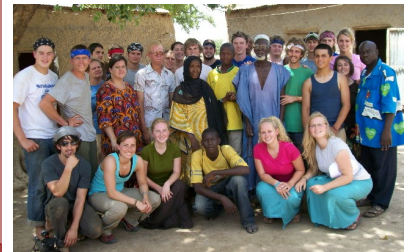
Mali outreach team & village chief

The short-term outreaches I've joined have had a variety of focuses. > In Romania I joined a medical team and trained local staff in how to stimulate communication skills with special-needs orphans. > In Aix-en-Provence, France, we met university students and talked with them about Jesus. > In Mali I interpreted French-English for a group of American students. We helped at an orphanage in the capital of Bamako, and we shared about Jesus & prayed for the sick in local villages. I also helped train staff, but this time in the area of motor skills instead of speech skills. Those years working along-side physical therapists paid off for a 7-year-old boy with cerebral palsy! My experience in this developing country was very intense. I take my "hat off" to those who choose to live there—they are truly making a difference in people's lives.